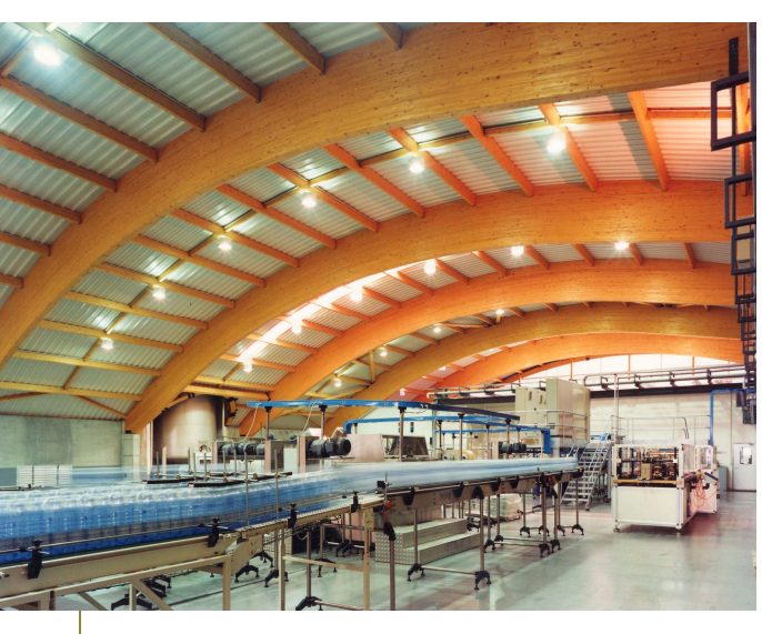
Example: Wattwiller Mineral Water Bottling Plant