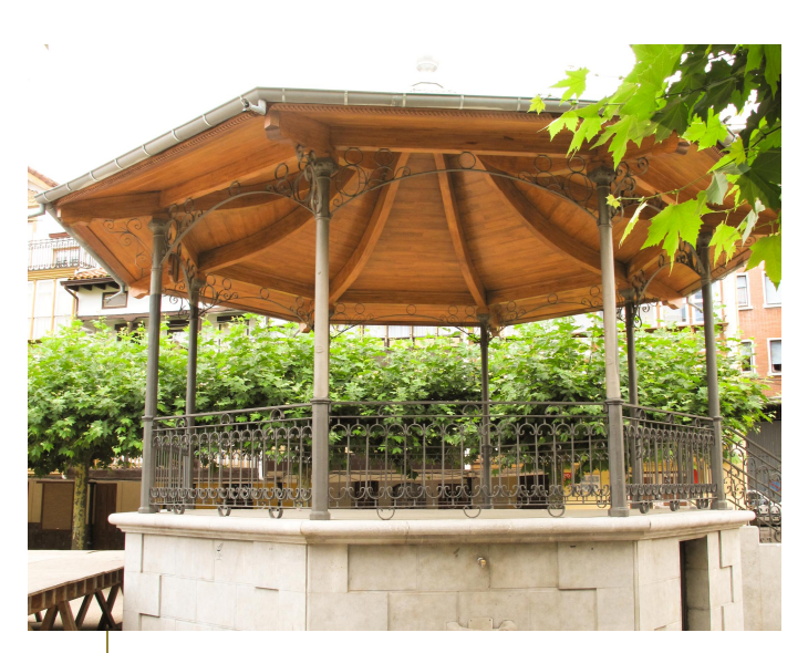
\mathsf{Example: structure in glued laminated oak} Sapisol^® insulated panels with oak under side Gazebo in Spain

We work regularly with such quality woods as spruce and pine and we select higher quality species such as oak, beech, ash, chestnut and red cedar for your higher end creations.