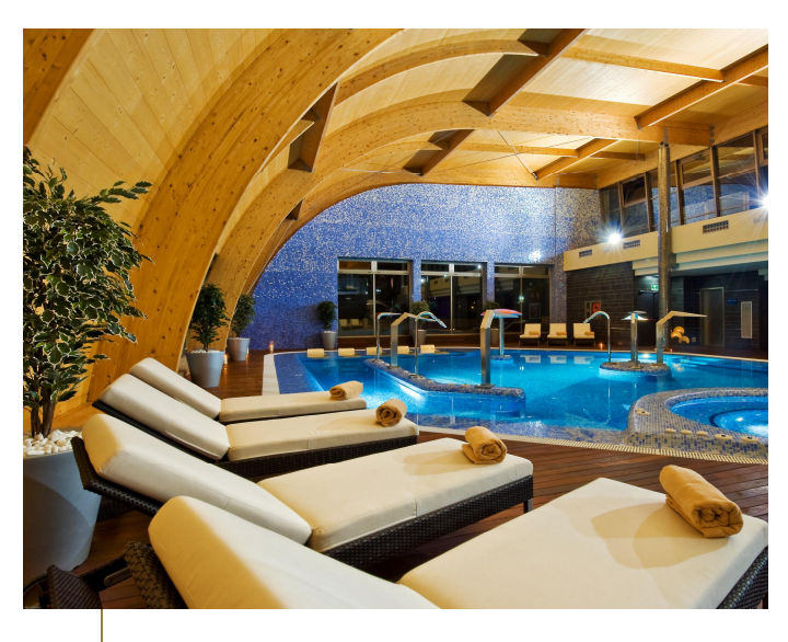
Example: Swimming Pool and Spa in Spain

Our technical know how is based on our mastery of glued laminated products. Our team pays particular attention to each and every detail in order to obtain a high quality end product.